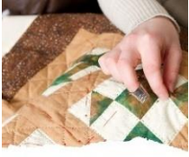
CALLING ALL QUILTERS!